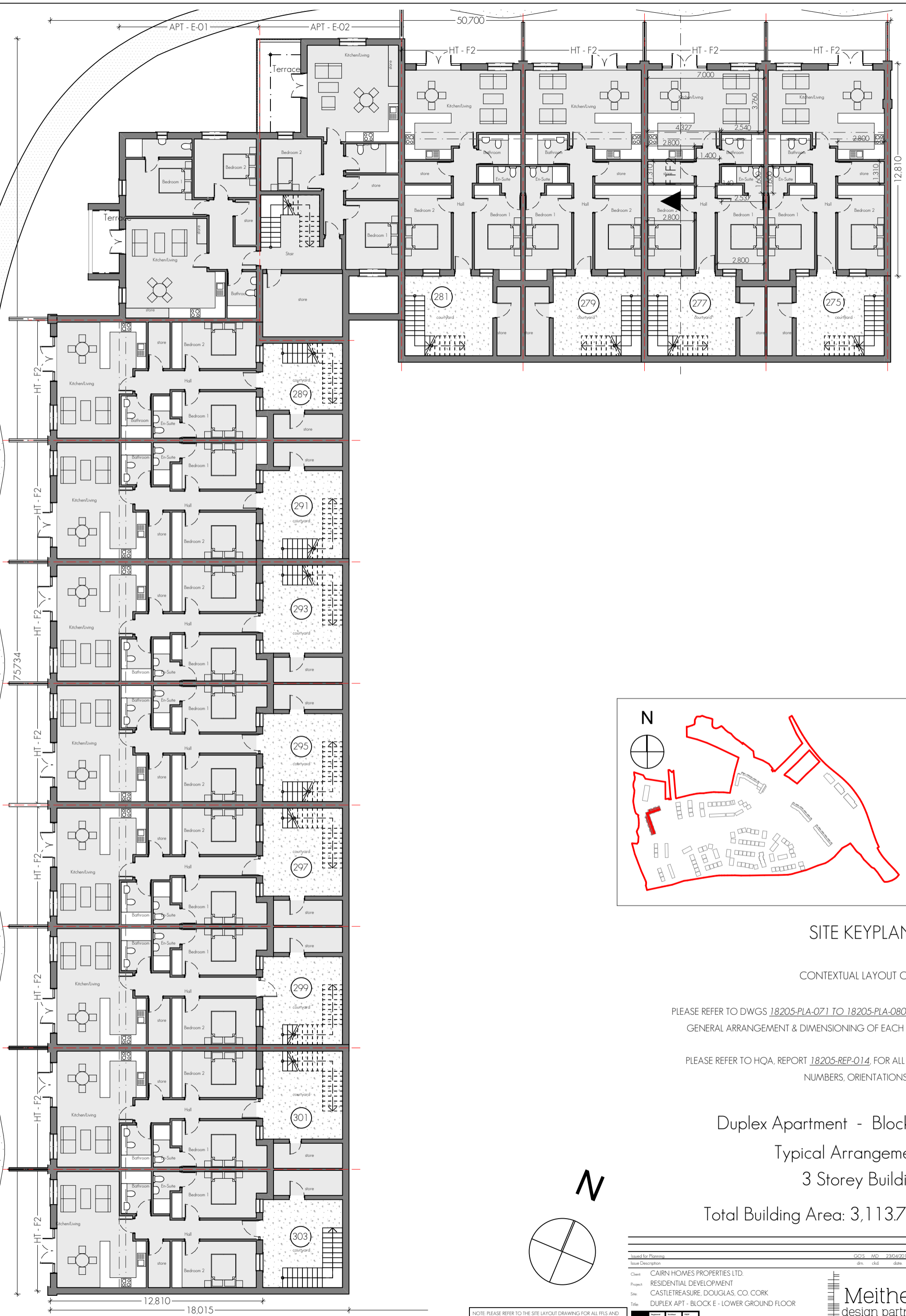
Contextual Lower Ground Floor 1:200